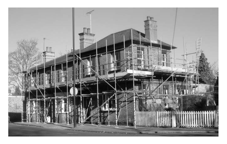
The Black Horse is getting a major facelift and extension.