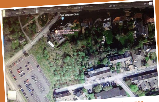
Spare land that nearby residents say could be used to provide additional car parking on the hospital site

While welcoming the MP's support, residents say their hopes for relief from excessive hospital car parking in nearby roads are rather tenuous in view of the "decidedly vague and non-committal language" used by Sir David.