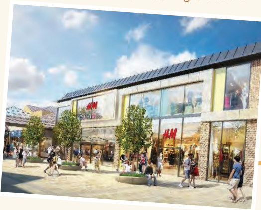
L-R New Flats being built on the 'New Ground' complex, Barnet High Street from above, and plans of the new Spires shopping centre