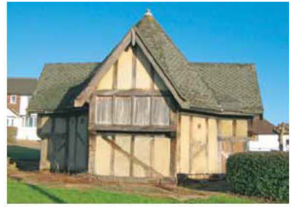
The Council has pledged to restore the Physic Well