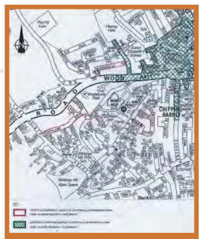
Kings Road and Grimsdyke Crescent are two of roads which the residents fear will now become an unofficial car park for staff and visitors at Barnet Hospital Grimsdyke Crescent is one of the roads where angry residents are complaining at Barnet Council's delay in imposing a controlled parking zone.

"It is frustrating that this hasn't taken place at the speed I requested...The officers decided to wait until after the local election 'purdah' period for the consultation, a decision which knocks all the timings back.