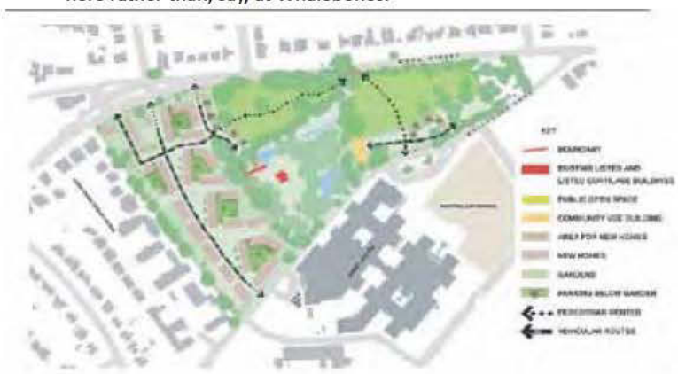
Design for the Whalebones Estate

Three year ago we supported a plan for housing and affordable workspace on the Brake Shear House site. The property was sold on to Shanly Homes, who've now submitted a new application. More units are proposed – 68 flats: 40% affordable, and a few with gardens – plus affordable workspace. The design lacks the individuality of the previous scheme and would rise to five stories, but is sensible and almost invisible from the High Street. We're minded to support it. We need more homes, and would prefer them here rather than, say, at Whalebones.