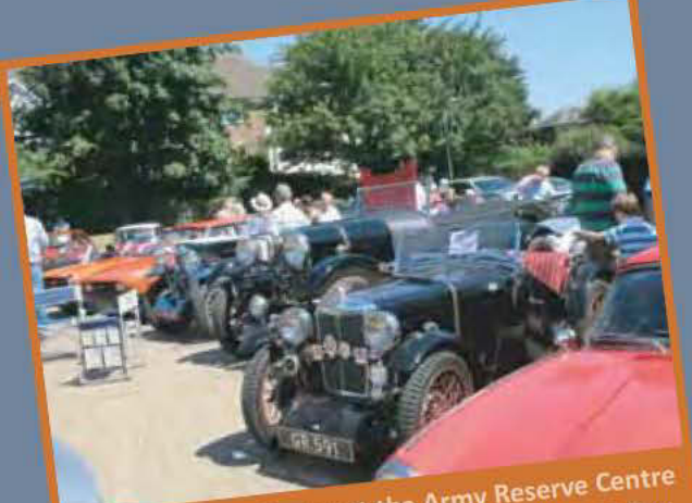
Classic cars on display at the Army Reserve Centre in St Albans Road in support of Armed Forces Day

The only hitch was caused by roadworks near the Red Lion public house which slowed down the procession of classic cars up Barnet Hill and along the High Street towards St Albans Road.