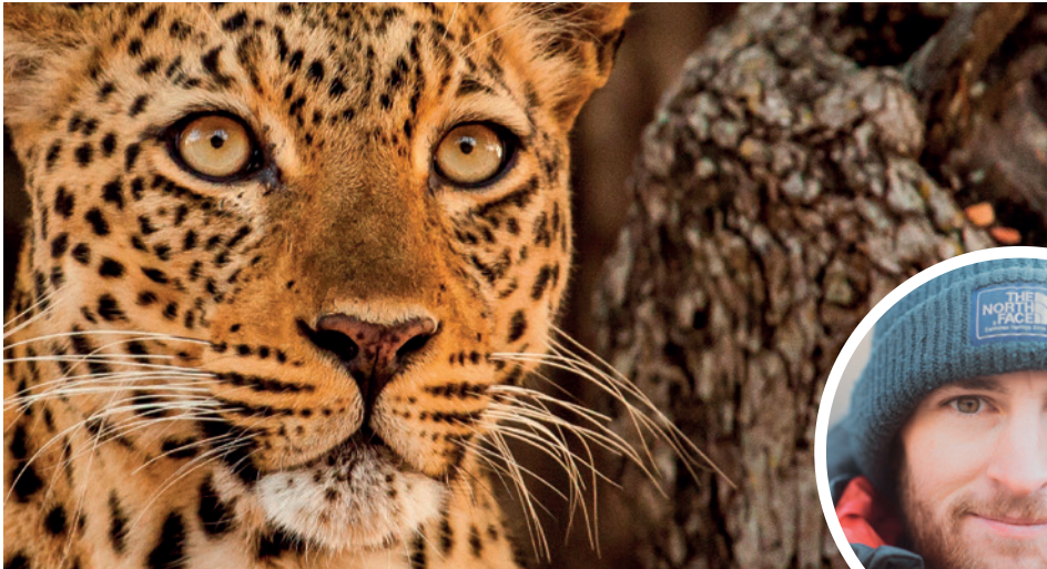
Spot on: a picture of a leopard that Sam took when he was filming in Zambia. Sam (below) on location