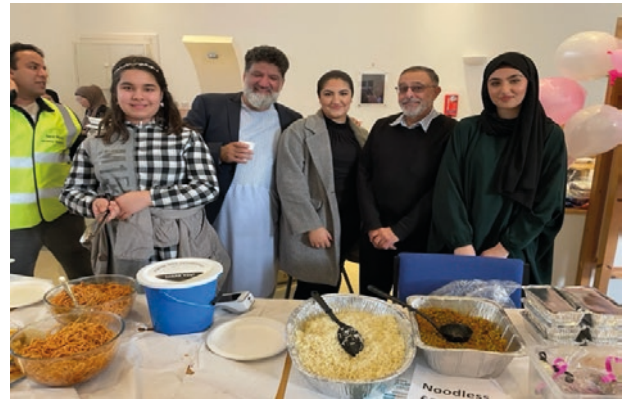
(Left) the new Darul Noor Islamic Centre. (Above) members cooked a range of dishes for the open day and (Below) some of the many children who took part in activities such as colouring in and face painting