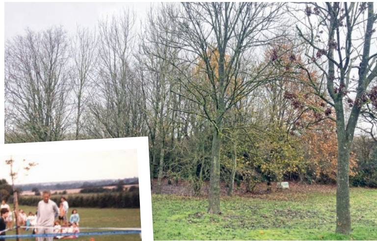
(Left) the children at the tree planting in 1988 and (above) the woodland as it is now, 35 years later

“We are extremely lucky to have a School community that value our environment and anything we can do to take it forward for future generations is done with love and pride.” – Lee Crocker