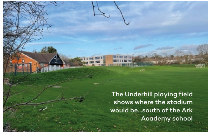
The Underhill playing field shows where the stadium would be...south of the Ark Academy school

The benefits would have to outweigh the detriment and that was hard to see “as a new stadium would cause additional pressure on local roads and highways”.