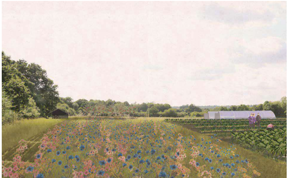
Visualisation of Academy farm by Assemble Design

We still await a date for the Whalebones estate application for 152 homes go to Planning Committee, also for TfL/Taylor Wimpey's application for High Barnet Station. Other significant cases are summarised.