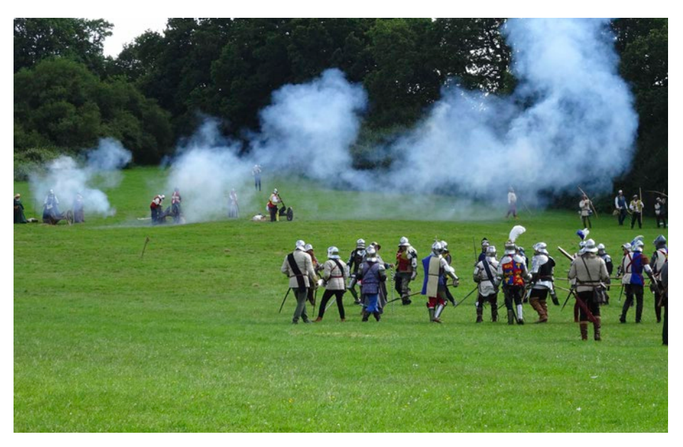
Plans for Byng Road rugby pitches could threaten the annual medieval festival

Special circumstances surround the application by Barnet Elizabethans Rugby Football Club to replace their clubhouse and improve their pitches on Byng Road Playing Fields. We're neutral about it: we have reservations, especially about the landscaping which could threaten the future of the Medieval Festival; but it does