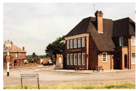
The Jester in its hey-day (above) and now the pile of rubble that stands today and which neither council nor developer can agree on its future development

"Of course, we would be delighted to see it rebuilt and re-opened as a community pub"