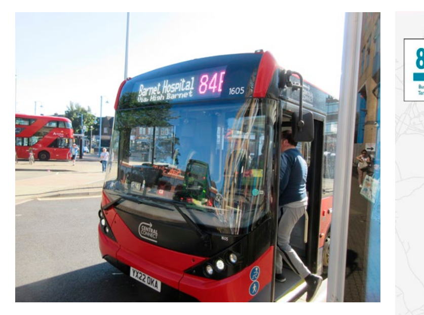
On the buses: The 84 bus, back in its new guise as the 84B