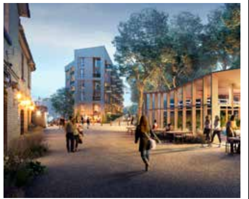
A new 'square and community' hub would offer a flexible workspace-café with fast broadband