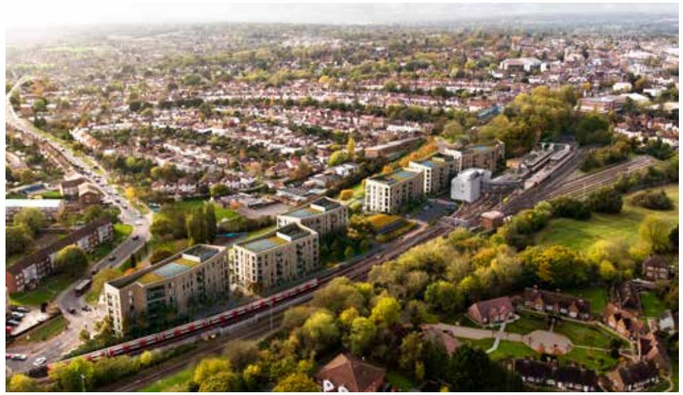
An aerial view of the revised development - the six blocks have been described as 'monotonous'