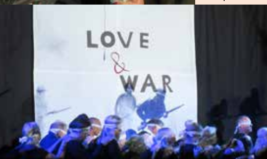
A finale from Oh What a Lovely War rounded off the Bull Players' first production, Love and War, at the Bull Theatre

class, the cast members volunteer for a range of duties at the Bull, including serving as ushers and ice cream sellers.