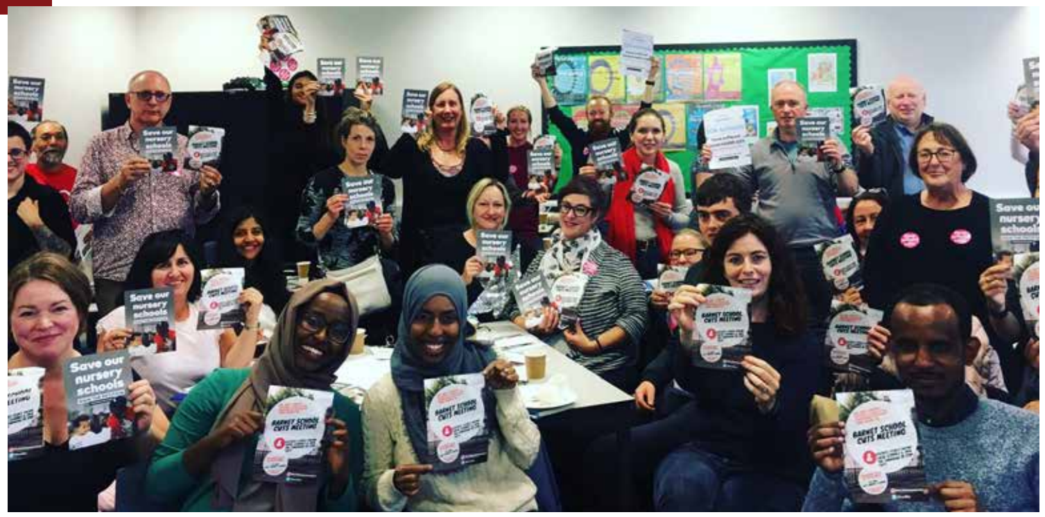
Parents, carers, teachers and residents bare all supporting campaign against futher nursery school cuts