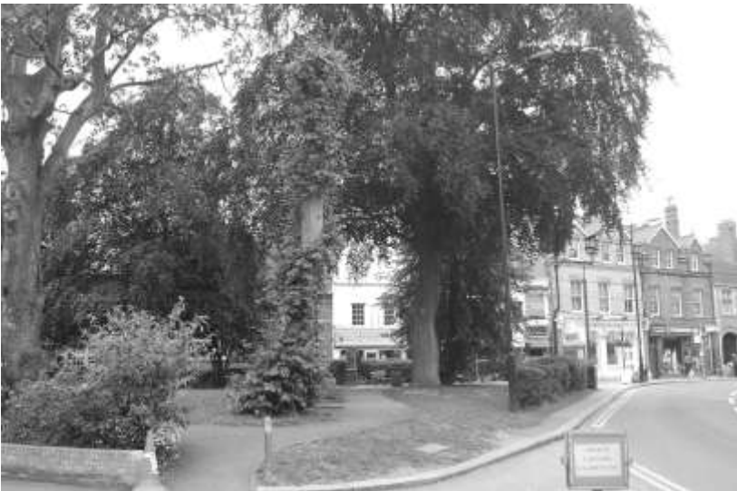
St John the Baptist Churchyard and the High Street